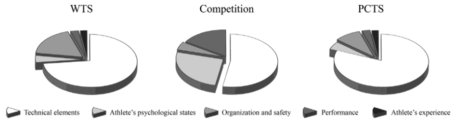
Fig. 2. Distribution of compatible information elements between the athletes' and coaches' SA according to session.

what the athlete focused on, thought, and felt, than they explained possible causes of athlete's behavior and situation, and whether the athlete's behavior and situation fitted ideal/expected behavior and situation. However, in comparison to athletes, coaches more frequently compared the phenotype with genotype schemata (see also Table 4).