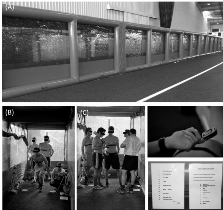
Figure 1. Illustration of the mobile inflatable simulated hypoxic equipment used for repeated-sprint training sessions. External (A, overall view of the 45-m long marquee) and inside tunnel view with players completing sprints (B) and monitoring their psychophysiological responses (C).